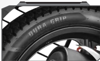
DURA GRIP TYRES