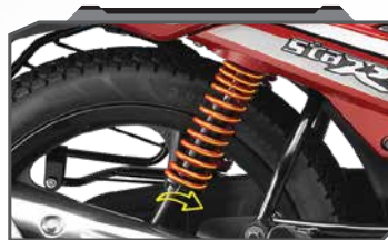
5-STEP ADJUSTABLE SHOCK ABSORBERS