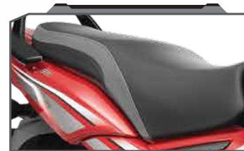
PREMIUM DUAL-TONE SEAT