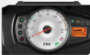
MULTI-FUNCTIONAL DIGITAL CONSOLE